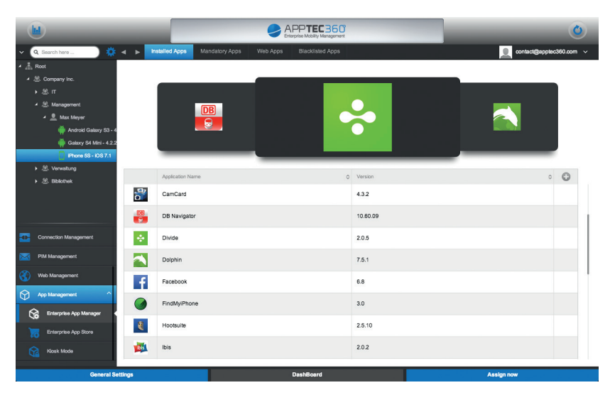
With AppTec Enterprise Mobile Manager you can easily manage your Apps.

The use of private devices also presents new challenges for the security of smart phones and tables. IT administrators must manage a wide range of various devices since employees increasingly want to use their smart phones at work. We can help you to easily secure all devices and the sensitive data stored on them and to manage them from a intuitive console.